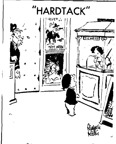
"Can I apen a charge account?"